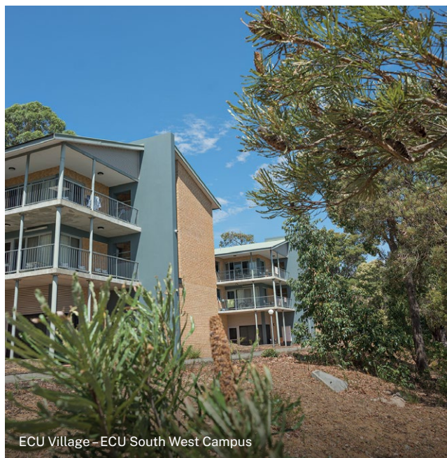
ECU Village – ECU South West Campus