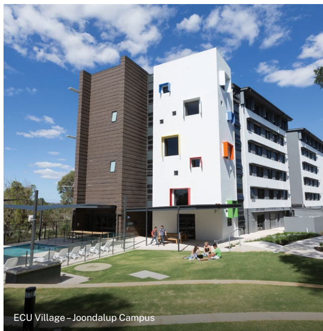
ECU Village – Joondalup Campus