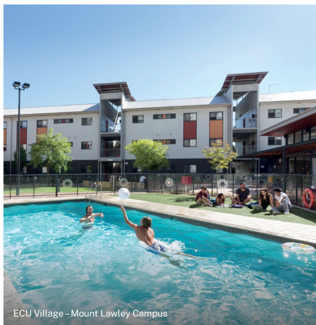
ECU Village – Mount Lawley Campus